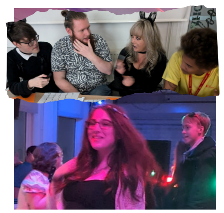
Scarefest, Frights and Fantasy!

To celebrate the turn of the season, you joined us at Alton Towers Scarefest! Before reading week, we hosted Frights and Fantasy. This was a huge collaborative effort with MaDSoc, Senses Lounge and a fantastic student panel which judged our Fancy Dress Competition. We hope you had as much fun as we did. Join us for the next big event!